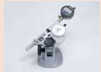
ABS Digimatic Indicator

ID-C (0.001mm) / 543-390B LGF-L (0.0001mm) / 542-181 & Counter 542-015