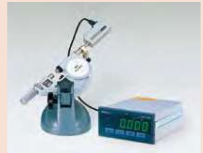
Linear Gage and counter